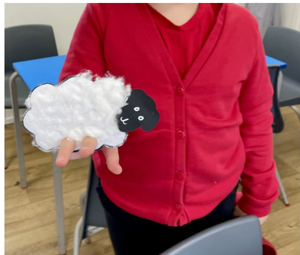
Finger Sheep Puppet